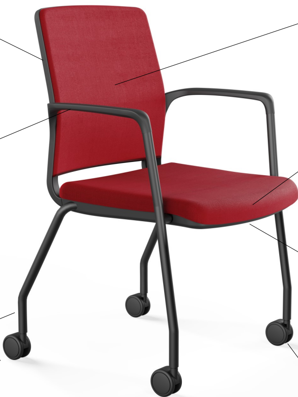
Tosca TAP 2 pz

Polypropylene (PP) black castors \varnothing 65 mm.